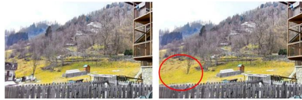
(a) Single-region forgery