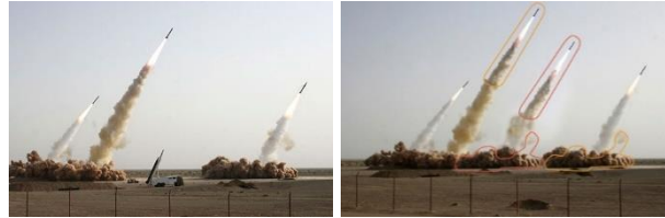
(b) Multi-regions forgery