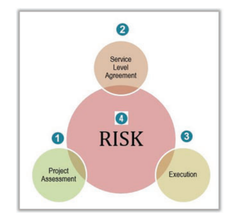
Figure 3: Enhanced OSMO process model

The authors compared our preliminary model with the data collected from the industry. The authors found that three clusters of our model are applicable in an industrial setting as they stand in the preliminary model. These three are Service Level Agreement (SLA), Execution, and Risk. However, in the Risk cluster, the practitioners believe that the risk is an umbrella activity and should be embedded in all clusters. Regarding the Decision-making cluster, the studied organizations believe that this activity is performed on the client side and is out of the scope of vendor side activities for the OSMO process. As for as the handover cluster is concerned, our results showed that handover activities are implemented in parallel to Execution cluster activities. Therefore, it was felt natural to merge both clusters under the Execution cluster. So, now our hybrid or enhanced OSMO process model consists of four clusters including (i) Project Assessment, (ii) Service Level Agreement, (iii) Execution, and (iv) Risk (see Fig. 3). Below the paper, briefly discuss the clusters of refined OSMO process model.