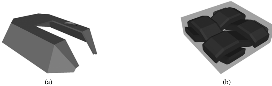
Figure 3: Multiscale model used in residual stress computations. a) Micro-scale unit cell model of woven fabric and resin. b) Snapshot of macro-scale composite part model.