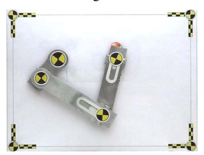
Figure 2: The four-bar prototype

link 4 can also be shifted giving an infinite combination of distances and angles. The round yellow-black position markers were placed using an 1/8 in cylindrical guide that was inserted in a center hole for each joint. The rectangular and circular position markers located in the corners were plotted on a sheet of paper and pasted on the wooden base of the model. It was required that the sheet was placed using the minimum inner cuts to avoid bad edges detection.