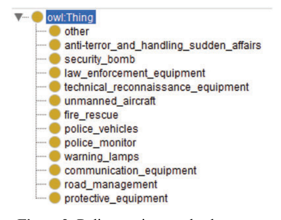
Figure 2: Police equipment body structure