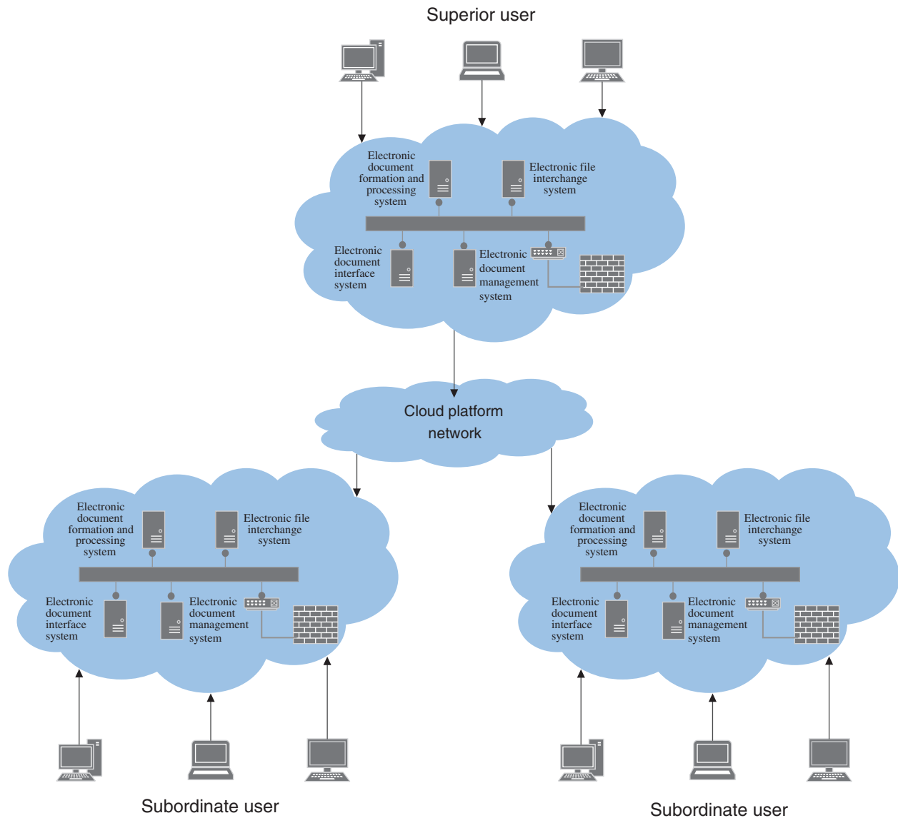
Figure 3: Cloud-based electronic file management system deployment

health status of the information system resources, and create a controllable IT environment to ensure various business application systems of the user information system. It can operate reliably, efficiently, continuously and safely.