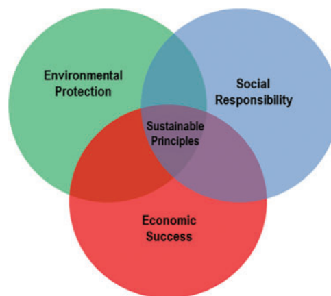
Figure 1: Three elements of triple bottom line (TBL)

The concept of the triple bottom line resolves around profit, people, and planet where each category is considered in all business operations [1]. As supplier selection is a fundamental problem in today's supply chain, applying this concept assists in the determination of the criteria suitable for the selection process to be smoother. Three elements of triple bottom line (TBL) are shown in Fig. 1.