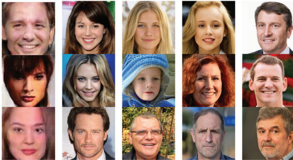
Figure 2: Some examples of GAN generated faces, including DCGAN, ProGAN, StyleGAN, StyleGAN2, StyleGAN3 (left to right columns)

The original GAN can only generate low resolution pictures, and the effect is relatively poor. Then, researchers carry out a series of research on the quality of face image generation. Radford et al. [7] combine convolution structure with GAN called DCGAN, which makes GAN easier to deal with many problems in the image field. Karras et al. [8] propose ProGAN based on step-by-step amplification training method to solve the problem of model collapse when generating high-resolution pictures. Then, inspired by style transfer, they decouple the input vectors to realize style control and propose StyleGAN [9], so that the generator can generate high quality and diverse face images with specified features. For the water droplet artifacts of faces generated by StyleGAN, they also propose StyleGAN2 [10] to further improve the quality of the generated face. Lately, Karras et al. [11] improve the generator network structure of StyleGAN2 to make it have high-quality equivariance. Fig. 2 shows some examples of the above GAN generated face and it can be found that it is difficult for human eyes to detect the difference between them and natural faces in addition to DCGAN.