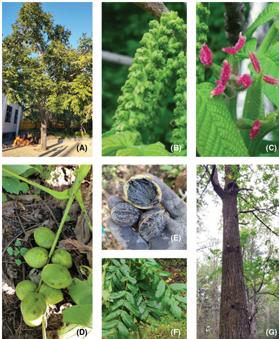
Figure 1: Morphological characteristics of J. mandshurica (A: Single plant; B: Male flowers; C: Female flowers; D: Fruits; E: Green peel and kernel; F: Leaves; G: Trunk)

can be used as an excellent grafting rootstock to graft other kinds of Juglans species [7]. Moreover, it produces good quality timber in forest plantations because of its excellent wood traits and fast growth rate [8,9]. It is also used as food supplements due to its edible dried fruits with high nutritional content [10]. More importantly, the green peel, leaves, bark and other tissues of J. mandshurica can be used for medicinal purposes and have been used in the development of traditional medicines [11]. At present, studies on medicinal component have found that triterpenoids [12,13], flavonoids [14,15], quinones [16] and other compounds contained in J. mandshurica have great effects in treating cancer, lowering blood lipids and exert antioxidative, anti-inflammatory and other effects. Unfortunately, the wild germplasm resources of J. mandshurica declined seriously in the past few decades. Large numbers of trees were overharvested because of the increasing wood price and lack of protection policies [17].