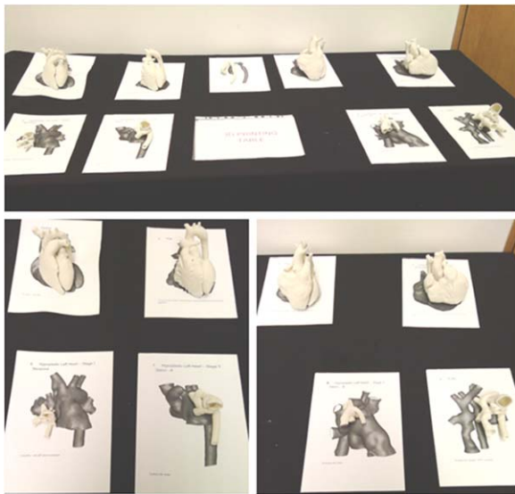
FIGURE 1 Models were displayed on a table outside the lecture theatre and nurses were invited to explore their features during the course. Labels included a 2D image of the model itself, the name of the defect being depicted, as well as the age and sex of the patient

and recommendations. The first three questions focused on the learning experience and information elements of the models and were answered on a 5-point Likert scale (1-strongly agree to 5-strongly disagree). The fourth question addressed potential attributes of the model in terms of facilitating understanding, asking nurses to indicate, by ticking if applicable, whether they agreed with a series of statements (e.g., 3D patient-specific models helped me to appreciate anatomical complexity of repaired CHD) and the final question asked participants to rate all nine models on a 7-point Likert-scale from 1 = “not useful at all” to 7 = “extremely useful.” Finally, an option was given to leave additional feedback.