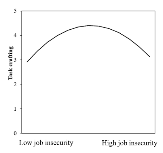
Figure 2: Inverted U-shape relationship between job insecurity and task crafting

Tab. 4 shows that strengths-based psychological climate significantly interacted with job insecurity to influence task crafting ( \beta=0.44,~p<0.01 ). Furthermore, strengths-based psychological climate significantly interacted with job insecurity-squared to influence task crafting ( \beta=0.18,~p<0.05 ), and R^2 increased from 0.24 to 0.53( \Delta R^2=0.29,~p<0.01 ).