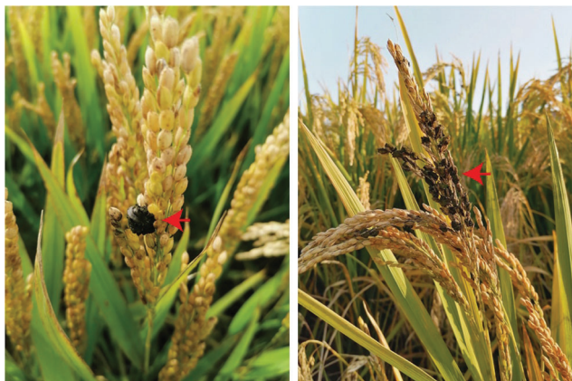
Figure 1: Disease symptoms of rice false smut. Natural infection of Ustilaginoidea virens to rice that cause the fungal diseases. The red arrows indicated false smut balls, which is covered by chlamydo-spore on the infected spikelets

interaction triggers rapid and robust defense responses, usually accompanied by the hypersensitive response (HR), called effector-triggered immunity (ETI) [16–18].