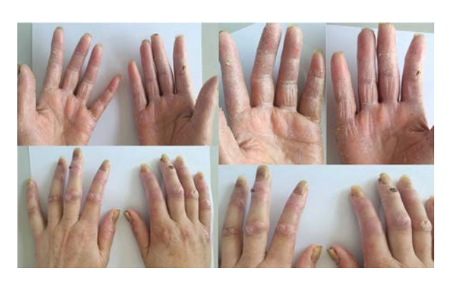
Figure 1. Severe hand–foot syndrome in the patient after the fourth cycle of chemotherapy, with loss of fingerprints, peeling of skin, blisters, chapping, and scabbing in some areas.

Chinese researchers have proposed a "full-course management strategy" for advanced breast cancer. Combination