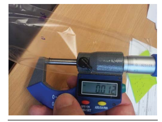
Figure 3 Thin extruded thermoplastic starch film at 12 micron produced at The University of Queensland.

There is a lack of understanding of processing starch films at low gauge (under 50 microns), as well as the subsequent relationships of processing–structure–properties of these films. A range of film properties such as pH resistance, bacterial resistance, temperature resistance, barrier resistance and changes in these properties over time, have also not been explored.